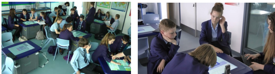
Figure 2: a) Classroom Camera b) Single Group Camera

The study was designed to investigate the relationship between students and the technology through their collaborative behaviours, and that between the teacher and the technology through her feedback and lesson plans. It was conducted over 4 sessions across a half term (6 weeks) in a UK secondary school classroom. The classroom was equipped with 8 smart tables, allowing 8 groups of 3-4 students to participate – 30 students in total. The students were native English speakers of mixed ability, studying English in Year 8 (aged 13-14, key stage 3). Each lesson was planned and facilitated by the class's usual English teacher, who also produced the session content. Sessions were scheduled to fit in with the existing timetable. The teacher met with the research team to discuss and improve the design before the study and had completed a collaborative writing task using CCW. She designed lesson plans to incorporate the technology into her teaching goals. 2-3 Researchers were present at each session, and sessions were filmed with a classroom camera and a single group camera (Figure 2). Before each CCW session, the students completed a collaborative exercise, either Digital Mysteries [10] (first 3 sessions) or a classroom debate (final session). The “in the wild” context also had significant practical ramifications, including: